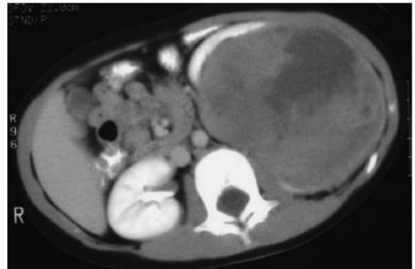
Figure 137-15. CT scan of a left Wilms tumor with a small rim of functioning renal parenchyma.