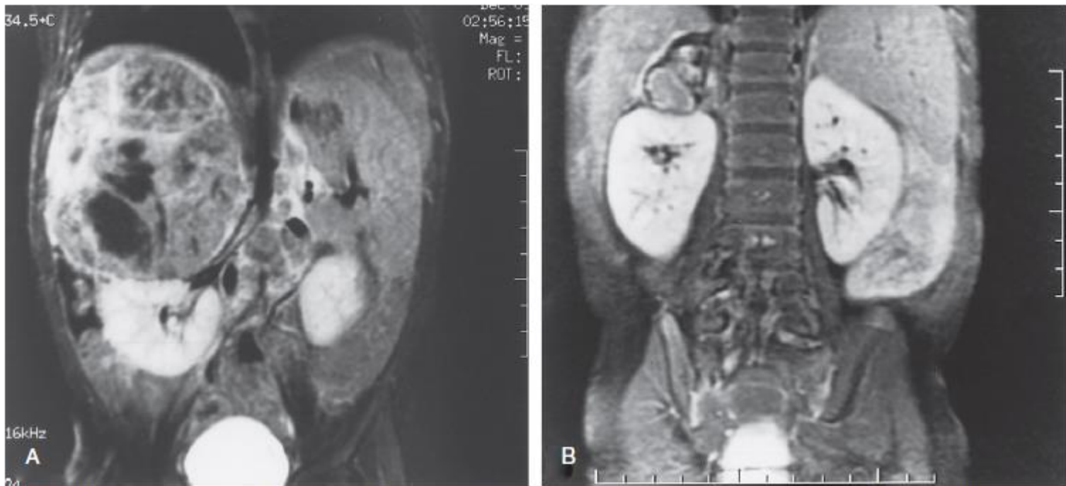
Figure 137-5. MRI before and after chemotherapy, showing marked reduction in size of right suprarenal neuroblastoma. A, Before chemotherapy. B, After chemotherapy.