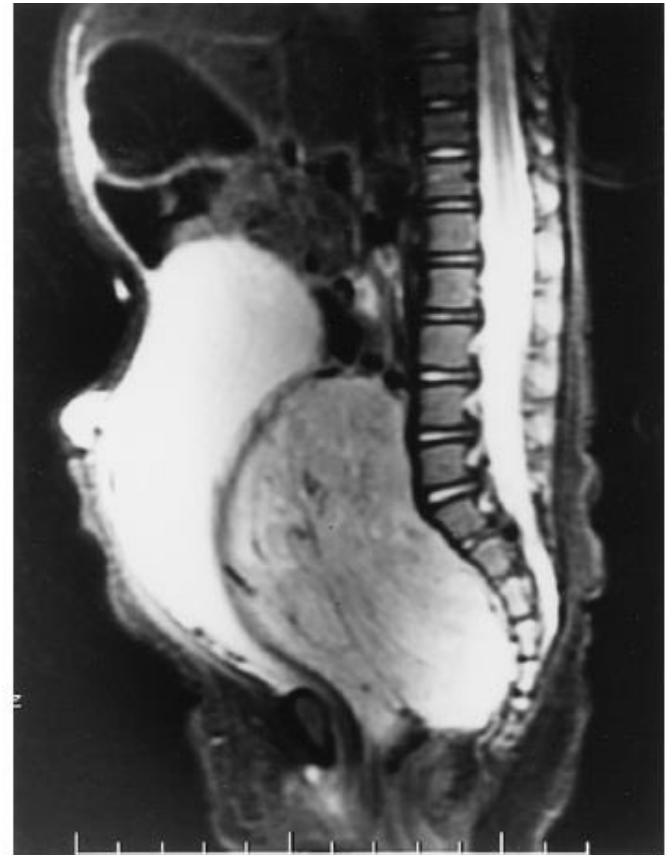
Figure 137-3. MRI demonstrating compression of bowel and bladder by a pelvic neuroblastoma.