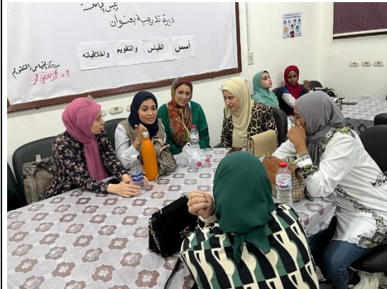
Foundations and ethics of measurement and assessment