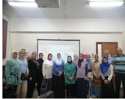
Professional Report Writing