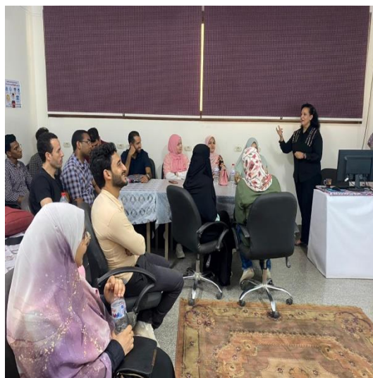
Formulating the test item