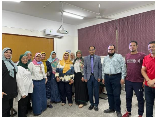
Training of Trainers